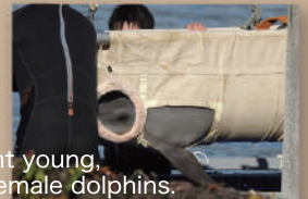
Aquariums want young, beautiful and female dolphins.

Hunters go out to sea to chase and capture dolphins. And then, dolphin trainers select dolphins to sell them to aquariums. The dolphins may get hurt and drowned in a sea.